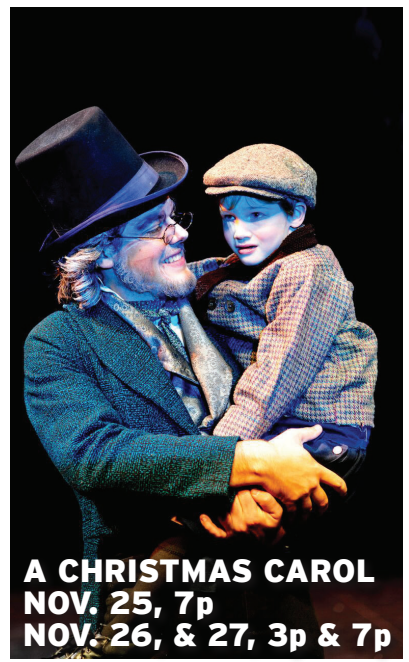
A CHRISTMAS CAROL NOV. 25, 7p NOV. 26, & 27, 3p & 7p