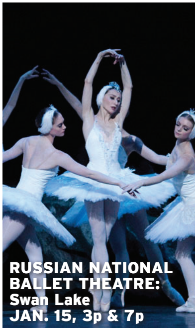
RUSSIAN NATIONAL BALLET THEATRE: Swan Lake JAN. 15, 3p & 7p