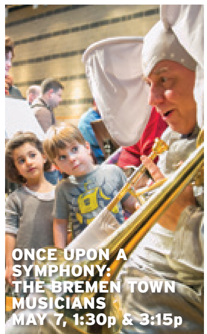
ONCE UPON A SYMPHONY: THE BREMEN TOWN MUSICIANS MAY 7, 1:30p & 3:15p

AtTheMAC.org 630.942.4000 McAninch Arts Center 425 Fawell Blvd, Glen Ellyn