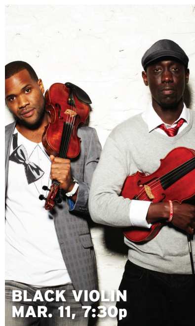
BLACK VIOLIN MAR. 11, 7:30p