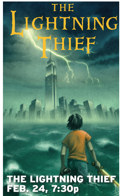
THE LIGHTNING THIEF FEB. 24, 7:30p