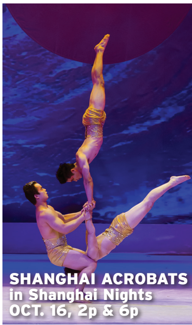
SHANGHAI ACROBATS in Shanghai Nights OCT. 16, 2p & 6p

30 ★ mac nificent years 2016-2017 SEASON