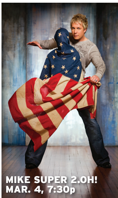
MIKE SUPER 2.OH! MAR. 4, 7:30p